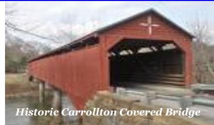
Historic Carrollton Covered Bridge